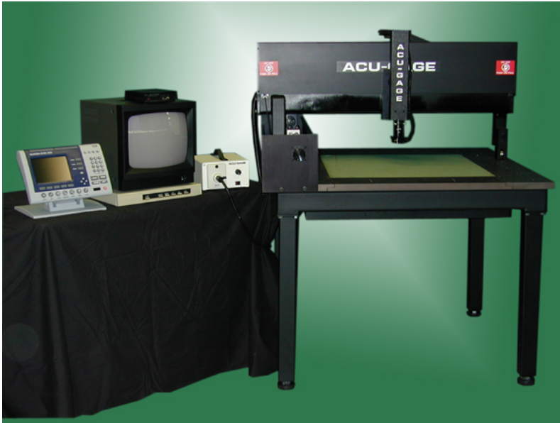
Left: A 24" x 24" (600mm x 600mm) Manual Inspection System