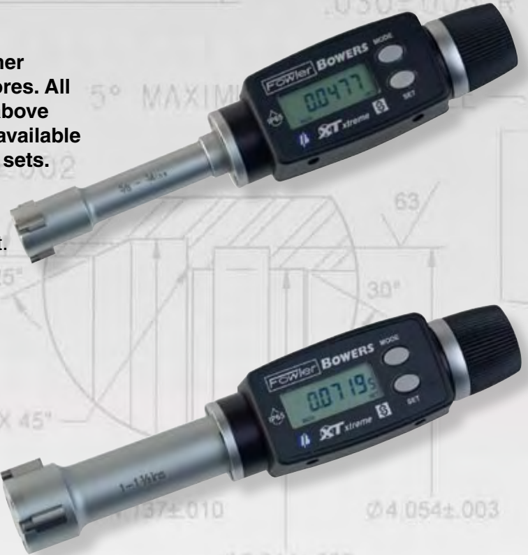
Sizes over .500"/12.5mm feature tungsten carbide anvils and blind bore measurement.